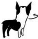
"PEACE!" look away/head turn