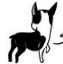
"RESPECT!" turn & walk away