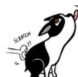
"I LOVE YOU, DON'T STOP"